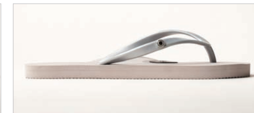
Women's Original Flip Flop – Silver WOFF-S