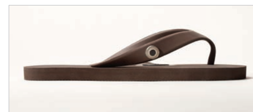
Men's Original Flip Flop – Brown MOFF-B