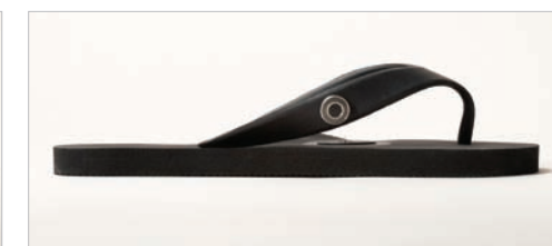
Men's Original Flip Flop – Graphite MOFF-G