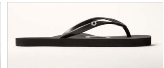
Women's Original Flip Flop – Black WOFF-B